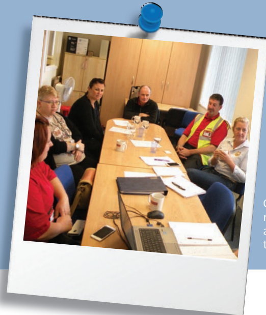
Customer Panel members made an official visit to Mears in May.